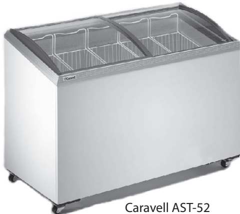
Caravell AST-52 Angled top for enhanced product display