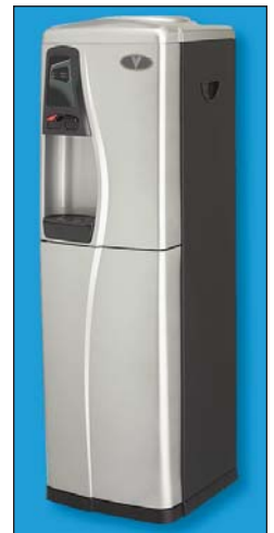
Silver and Black option.